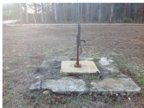
Old Well School - Original Pump

Working Towards Our First Tour in September!