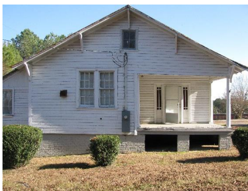
WCTS/NWHS Principal's Home Built 1924