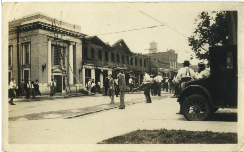
Aftermath of 1926 Warrenton Fire. The buildings burned housed a Shoe Shop, a Cafe and one other business with living quarters above.