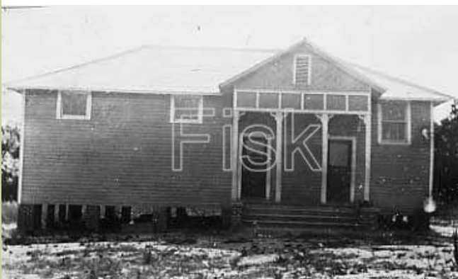
Johnson School 1930s - What happened to this building?

ELAMS SCHOOL – Well, I drove Elams Road and saw nothing. Any hints as to the fate of this two-teacher type school built in 1921-22 for $2,850?