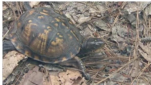
Click the picture above to watch the Tarheel Traveler episode about the Turtle Man!

This local treasure features the world's largest collection of K Line O Scale cabooses, freight cars, passenger cars, engines, and catalogs are available for sale, along with a large selection of William's O scale engines.